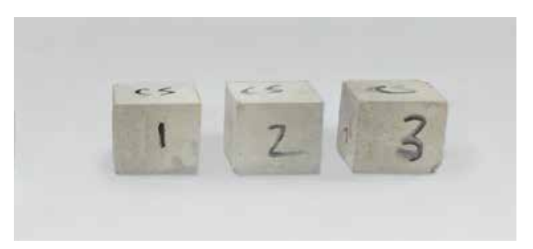
Mortar Mixed With CONCRETE SUPPLEMENT™ after 25 cycles of Freeze/Thaw Testing